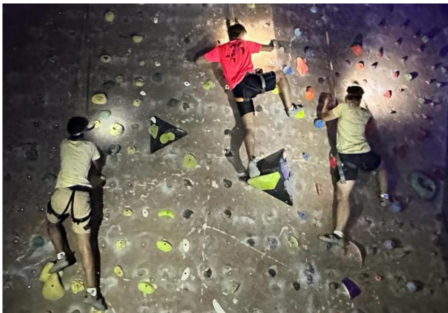
Climbers ascend rock wall in the dark during "Bouldering for Blindness"