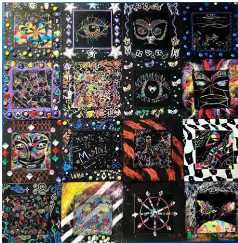
Interactive Community Art Project.

Art attendees enjoyed our various art exhibits, music by our Miami Lighthouse United Voices Choir, and our interactive community art experience that culminated in a collaborative magnificent mural. Our unique art show continues to embrace inclusion, diversity and equity in the arts.