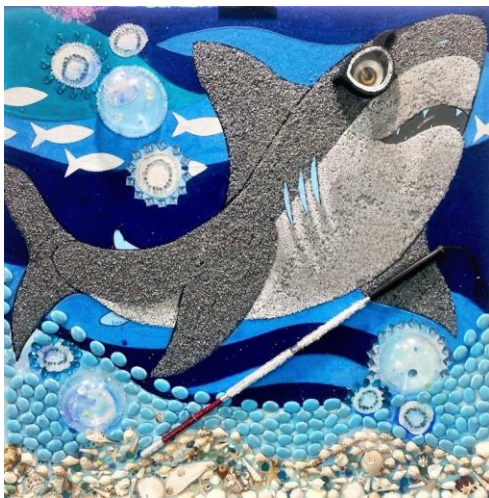
"See" Shark' created by Social Group Activities Program Participants.