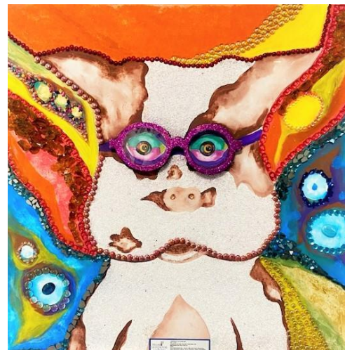
'Seeing Eye Dog #2' created by Social Group Activities Program Participants.