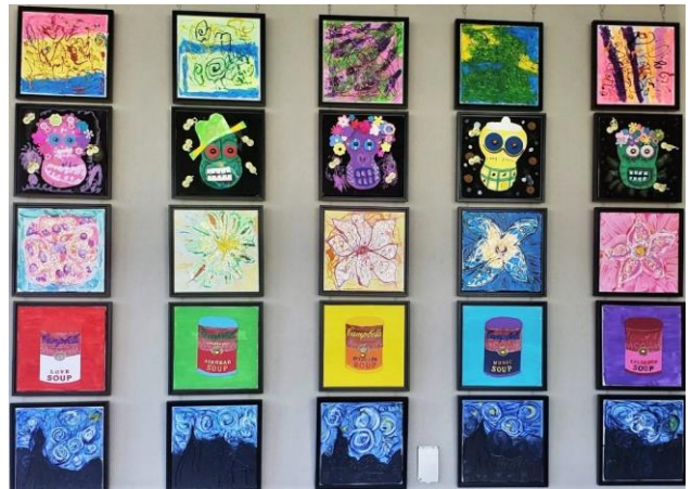
Miami Lighthouse Academy second grade student interpretations of famous artists.