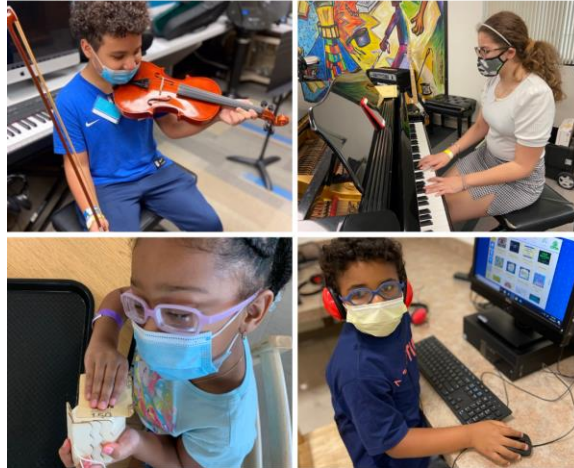
Miami Lighthouse Summer Camp Programs Photos