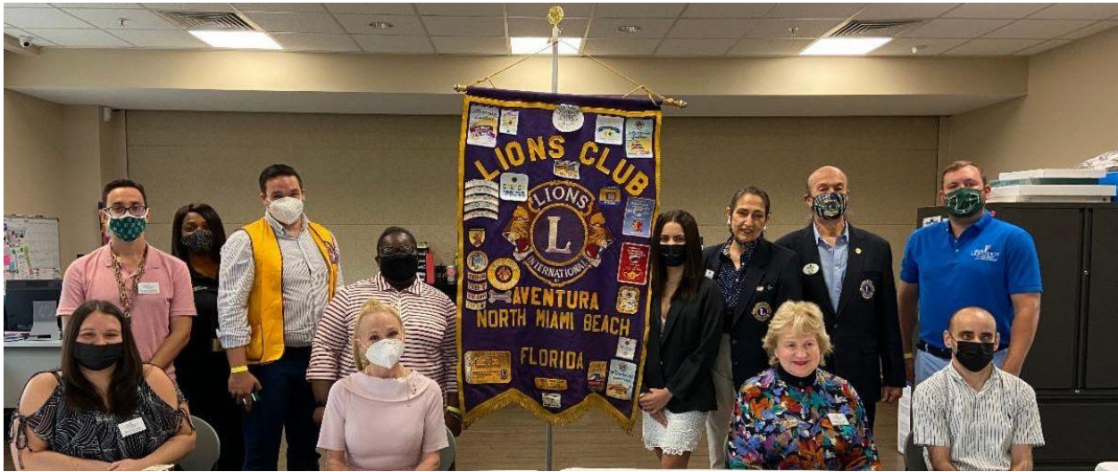
Aventura/North Miami Beach Lions Club with Miami Lighthouse scholarship recipients and staff