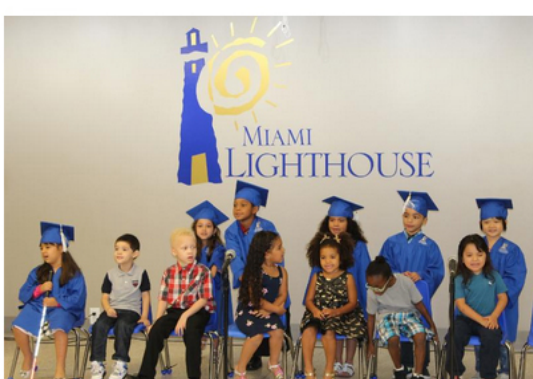
First class of Lighthouse Learning Center for Children™