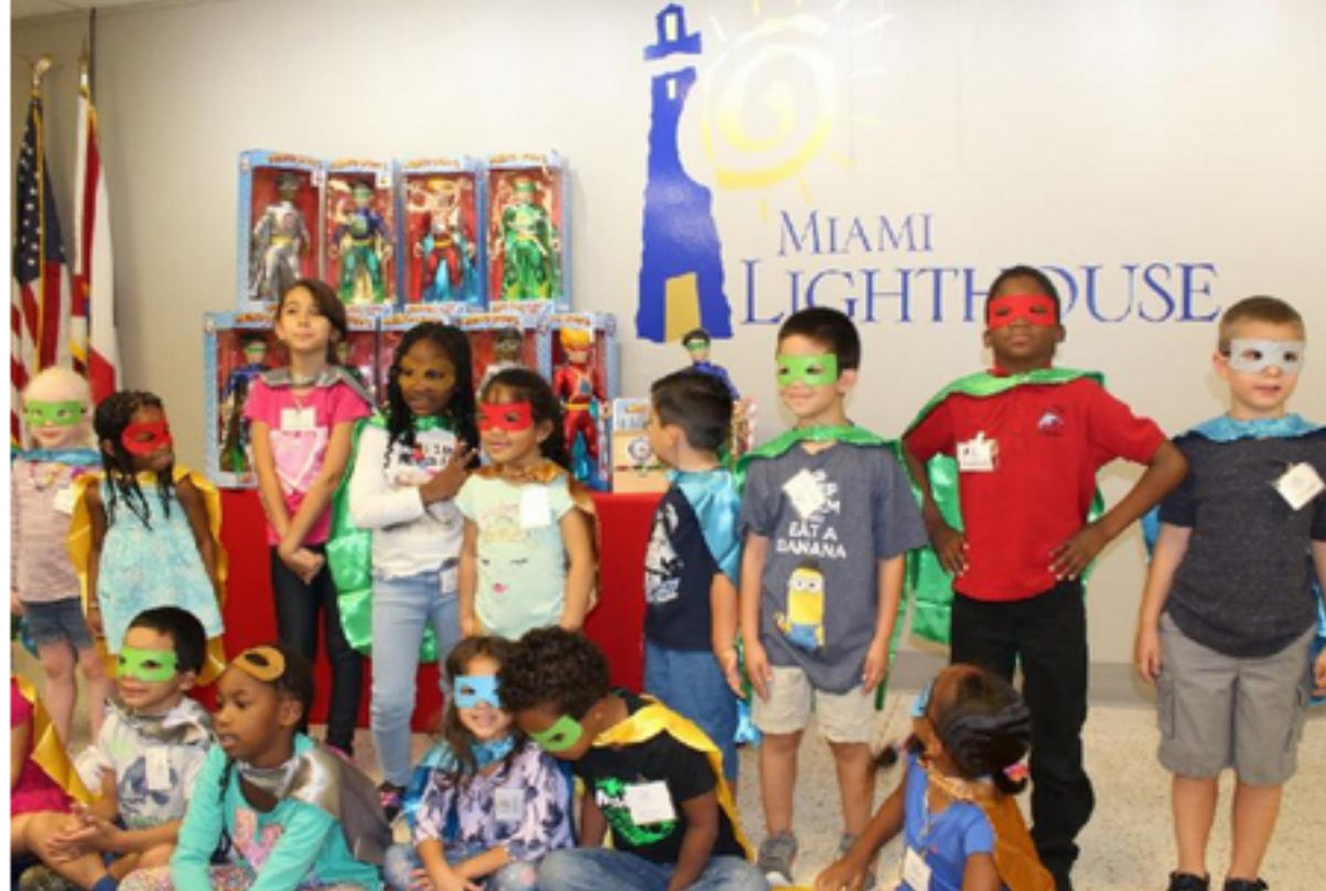
STAR Summer Campers pose with HeroBoys

On June 28th the HeroBoys visited Miami Lighthouse Summer Training and Recreation Program Campers to celebrate adventure, imagination, and limitless potential with blind children. HeroBoys is a line of toys and comic books created by parents aimed at using children's love of superheroes to reinforce positive values like honesty, loyalty, humility, compassion, and diligence.