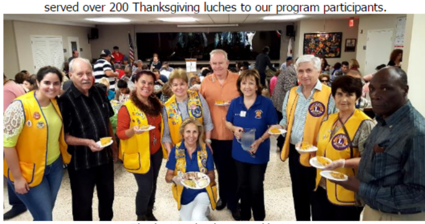
Thanksgiving lunches served by Lions

Continuing the 85 year tradition of Lions support, we thank the Lions who provided and served over 200 Thanksgiving lunches to our program participants.